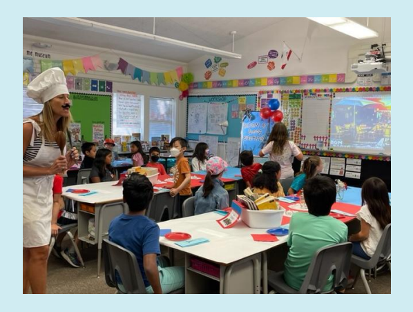
Thank you for the gift of your child,